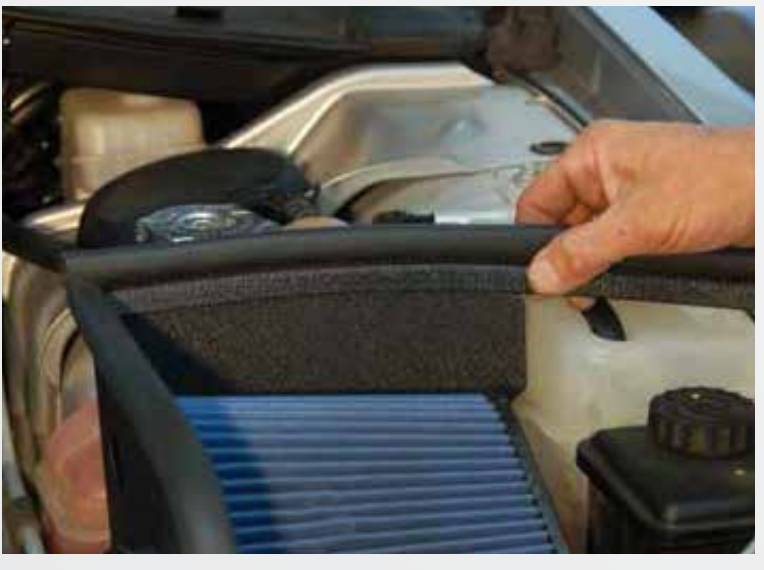
From the supplied hardware kit, find the aluminum pin and 1/4" Phillips screw and install on the BBK filter shield. Install the stock rubber grommet onto the pin. Install the supplied sponge rubber seal to the top of the filter shield.