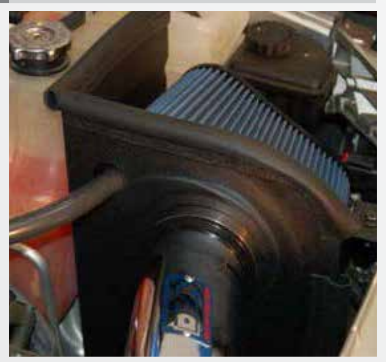
Place the supplied filter into the shield area and push the neck of the filter base, where the clamp mounts, through the opening in the filter shield. Install the BBK Inlet Tube into the filter and into the blue hose connector. Position for the best fitment and be sure the opening in the base of the filter lines up with the smaller hole in the filter shield. Then tighten the clamps.