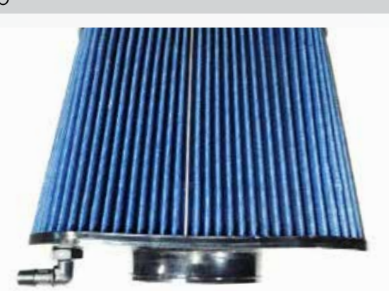
The 5.7L Engines require the use of the 90 degree fitting for the breather hose.