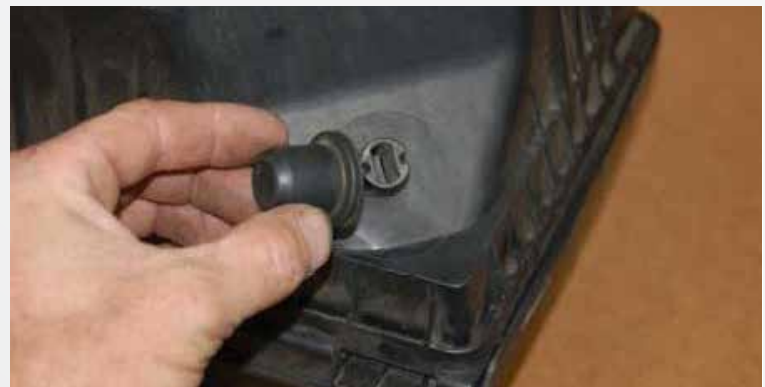
On the bottom rear of the stock air box, remove the rubber grommet for reuse with the BBK filter shield.