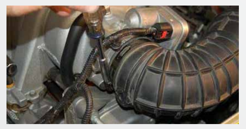
Unplug the air temperature sensor on the stock inlet tube. Remove the sensor for re-use in the BBK inlet tube. Loosen the clamp at the throttle body.