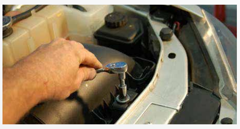
Remove the bolt that mounts the front of the air box to the vehicle. Lift out the air box and remove with the inlet hose.