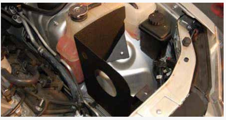
Place the filter shield into place in the engine compartment and line up the grommet with its hole. Mount the front tab of the filter shield using the stock bolt.