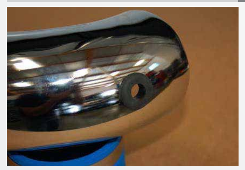
From the hardware kit, install the supplied rubber grommet into the hole in the BBK Inlet Tube. Install the Air Temperature Sensor into the grommet.