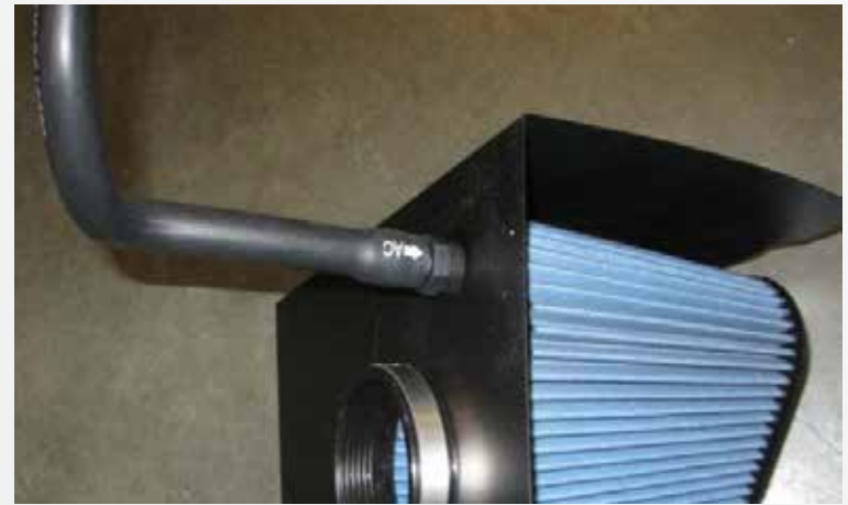
The 6.1L Engines require the use of the straight fitting for the breather hose.