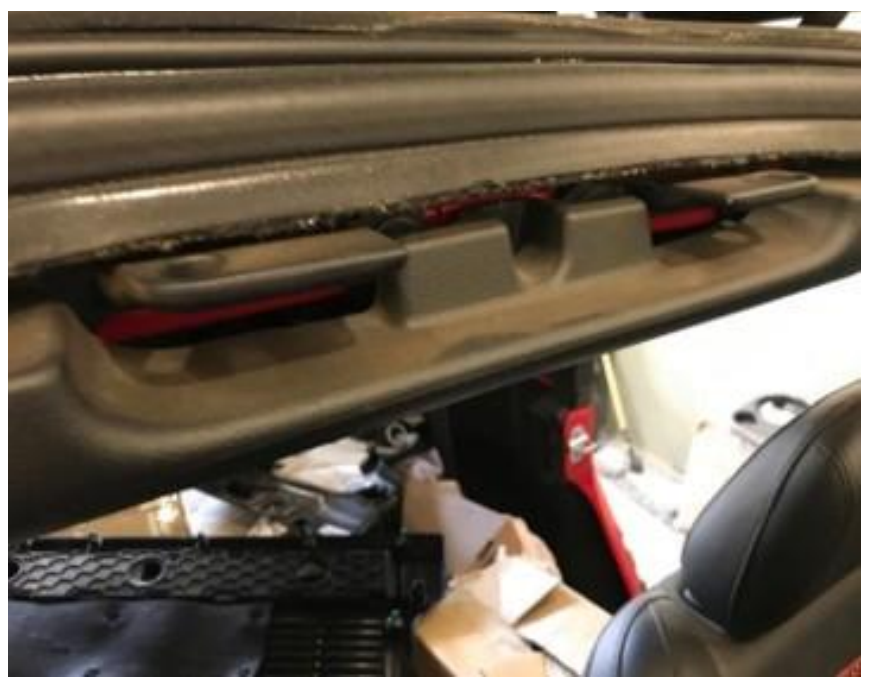
Again, there is a left and right. They should be configured so that the holes are toward outside of the Jeep (see below)

For the rear 2 brackets there are 3 bolts that need be removed that will allow you to access the bolt holes for the rear brackets (see below)