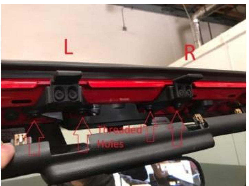
Tighten the 4 bolts to about 25 ft lbs

The front brackets will look like the photo to the left and will be marked with the letter L and R. The L bracket goes towards the driver side and the R bracket goes to the passenger side. There will be threaded holes where these will install. The hardware sent will contain 4 bolts to connect these front 2 brackets. There may be pint in the holes that makes the installation of the bolts more difficult.