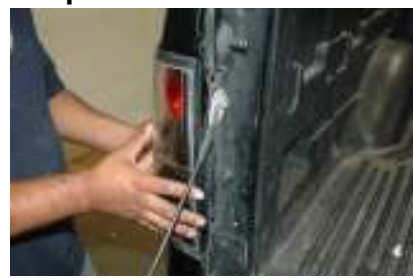
Install the Anzo tail light by reversing step 2