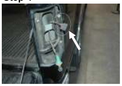
Remove the bulb from the black bulb housing