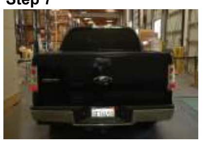
Test all functions before operating the vehicle