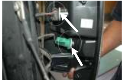
Plug the black bulb housing into into the Anzo tail light power source and the green light bulb into the Anzo tail light housing