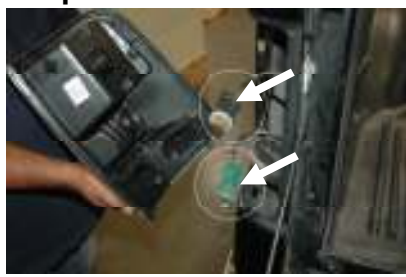
Remove the tail light by removing the green and black light bulb housings from the tail light