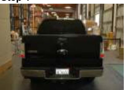
Tools needed: 8mm Socket