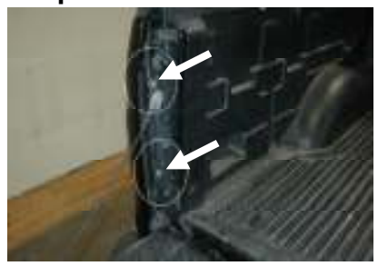
Remove the two 8mm screws located on the side of the tail light housing